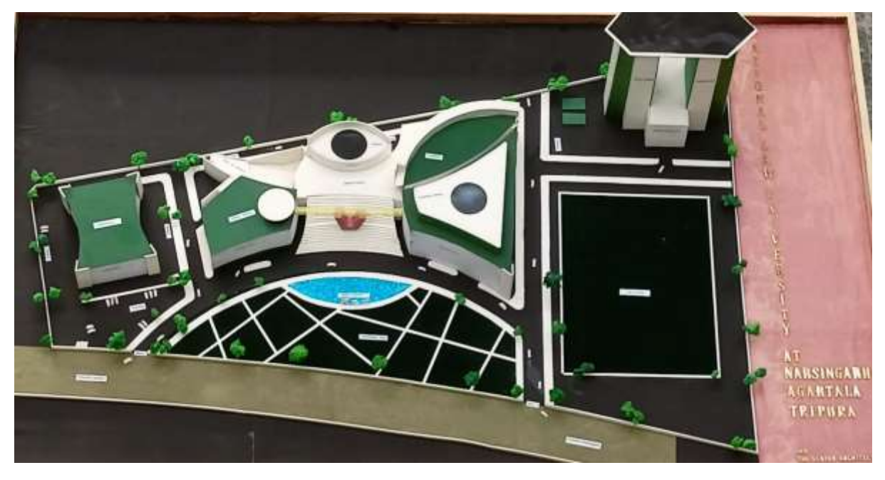
Architectural Model of NLU Tripura